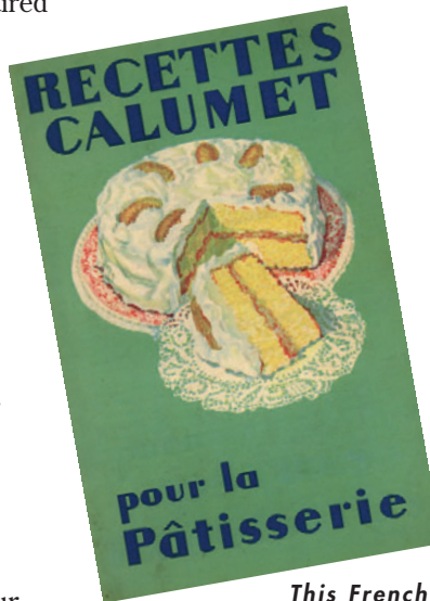
This French-Canadian cook booklet dates from 1930.