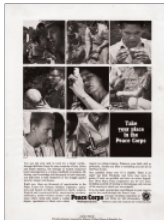
Peace Corps ad from the 1960s.

hunger, and disease." Fifty years later the Peace Corps continues to broaden and diversify its mission. Most recently, President George W. Bush sought to utilize the Corps in his broader War on Terrorism and asked to double its budget in 2004.