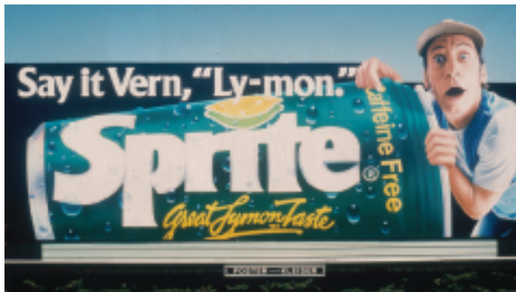
Sprite billboard ad featuring "Ernest" from 1987.

The Hartman Center announces the launch of ROAD 2.0, a digital collection of 27,000 outdoor advertising images spanning the 1910s-1980s. This collection is available at http://library.duke.edu/digitalcollections/outdoor_advertising/ and was made possible by a grant from the National Historic Publications and Records Commission (NHPRC).