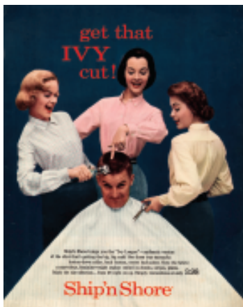
Circa 1950s ad for Ship'n Shore.