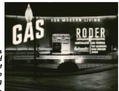
A Roper gas range billboard circa 1950s that is now part of the Outdoor Advertising Digital Collection.

About 14,000 photographs and negatives for ROAD 2.0 were digitized in Duke's Digital Production Center (DPC) and about 13,000 35mm slides were outsourced to a vendor. In addition to digital imaging, the Digitization Assistant, Rita Johnston, cleaned up some of the original 27,000 metadata records associated with the ROAD 2.0 images.