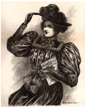
An image from the cover of the March 1895 issue of The Queen of Fashion , which was later to become McCalls .

Thanks to all our visitors and researchers for giving us the opportunity to welcome them to the Bingham Center!