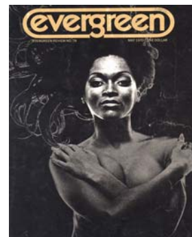
Evergreen Review No. 78, May, 1970

A slideshow of images from issues of Evergreen Review (see illustration at right) as well as the manifesto and other items from Morgan's papers brought this historical moment to life for workshop attendees. All of the activities included in the workshop were aimed at honing the participants' critical analysis skills and making them more savvy researchers.