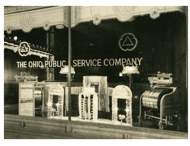
A Ohio Public Service Company store window displaying electrical appliances.

A 1923 Ohio Public Service Company portfolio of photographs and printed items documents the use of electricity for signage, nighttime display and home appliances. Many of the photographs depict the turbines, towers, and transformers employed in the