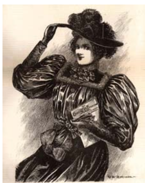
An image from the cover of the March 1895 issue of The Queen of Fashion , which was later to become McCalls .

Thanks to all our visitors and researchers for giving us the opportunity to welcome them to the Bingham Center!