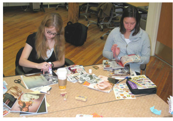
Students create collages during a zine workshop for a class on Zines and Comics Books

Students in Bill Fick's visual arts course, "Art of Zines and Comic Books," spent one class session in the Rare Book Room exploring materials from the Murray Comic Book Collection and our women's zines collections. The following week, we traveled to their classroom to conduct a zine-making workshop. In Caroline Light's women's studies course, "Sex and the Global Citizen," students used pamphlets, zines, and other ephemeral publications by women of color to explore issues of sexuality, citizenship, and power dynamics. Students in a research seminar on women and the military reviewed examples of World War II-era girls' literature, etiquette manuals for Army wives and servicemen, letters