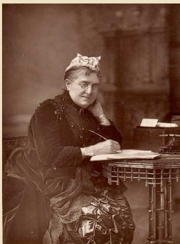
Eliza Lynn Linton

The collection comprises 130 titles, most of which are not available in digital form. It includes many of the 3- and 4- volume novels typical of the period, spans a broad range of literary genres, and includes works by Mary Braddon, Amy Levy, Eliza Lynn Linton, Mary Shelley, and many others. Many of the volumes, "silver-fork" novels, or novels of fashionable highlife, were central in establishing the triple-decker as an institution in Victorian culture.