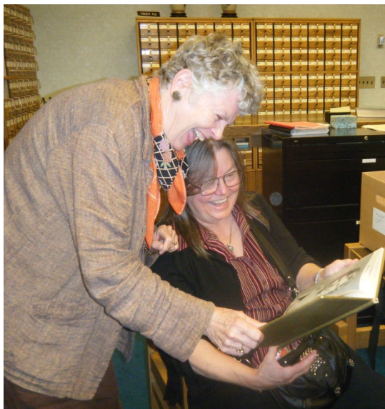
Lesbian feminist authors Minnie Bruce Pratt and Dorothy Allison share a laugh over Pratt's high school yearbook prior to speaking at that night's event: Out in the South: Writers in Conversation . Both authors' papers are available for research in the Sallie Bingham Center.