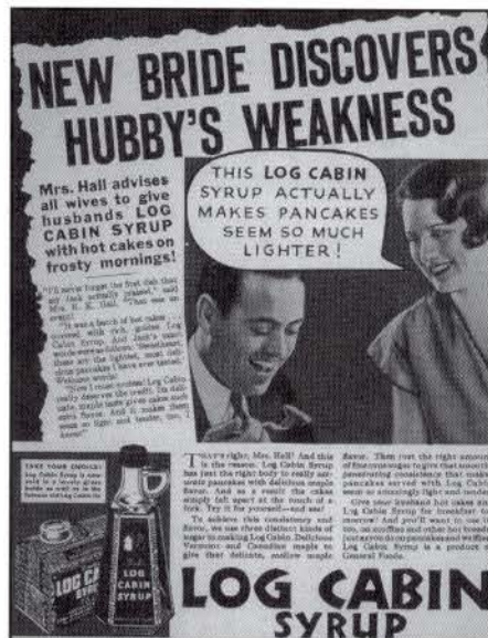
From the D'Arcy Masius Benton & Bowles Archives at Duke, this 1932 advertisement is one of five images used to make a set of Hartman Center premium postcards.

International Advertising Association Outdoor Advertising Magazine