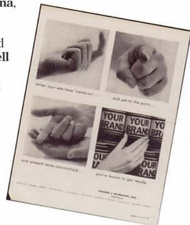
A 1957 Young & Rubicam ad.

Thanks to all of these donors for contributing to our strong resources!