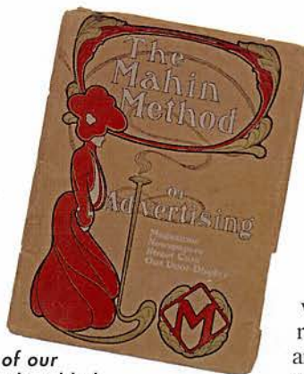
Two of our recently added printed materials.