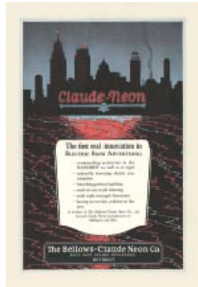
A booklet from the 1928 International Advertising Exposition.

The Hartman Center has acquired a number of new collections and books that enrich our holdings. The Center is now the home to the archives of the American Advertising Federation (AAF) Raleigh-Durham chapter. The collection has