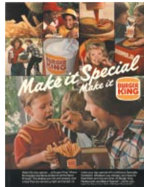
This 1980 sample Burger King ad is part of a recent JWT acquisition.