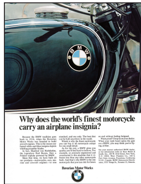
BMW ad featuring a Finelli photograph.

production and transmission of electricity. Also included are images of shop windows full of home electrical appliances of the day, such as washing machines and vacuum cleaners, tempting consumers to increase their use of electrical power. The portfolio is organized into eight sections: Development of Electric Light & Power; Analysis and Forecasting; Efficiency of Organization; Improvements in Construction Practice; Efficiency of Generation and Distribution; Extension of Service and New Customers; Customer Ownership; Introducing Domestic Appliances.