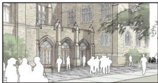
Architect's rendition of the entrance plaza to the renovated library.

Rubenstein is co-founder and managing director of The Carlyle Group, a global alternative asset manager. He graduated magna cum laude from Duke in 1970 and serves as vice chair of the university's Board of Trustees. In 2007, Rubenstein purchased the last privately owned copy of the Magna Carta at Sotheby's auction house in New York and, since then, has loaned it to the National Archives in Washington, D.C.