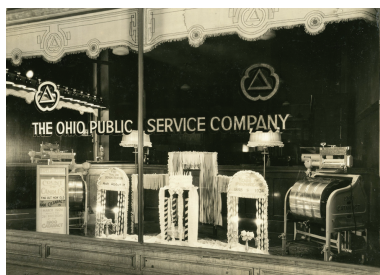
A Ohio Public Service Company store window displaying electrical appliances.

A 1923 Ohio Public Service Company portfolio of photographs and printed items documents the use of electricity for signage, nighttime display and home appliances. Many of the photographs depict the turbines, towers, and transformers employed in the