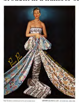
Peter Pan textiles, circa 1950s

Even though we have been busy moving into our new location, the Hartman Center has brought in a number of new and noteworthy col-