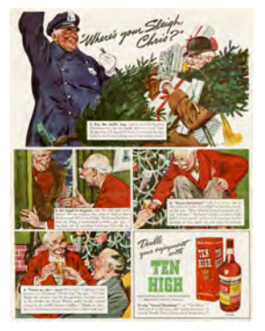
Hiram Walker ad, circa 1938

These sources, along with many others have been extremely useful in my research and provided me with a deeper understanding of how advertising agencies and their personnel operated in relation to their clients.