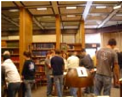
One of the three groups