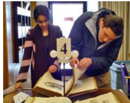
Students examining Haller and Bidloo