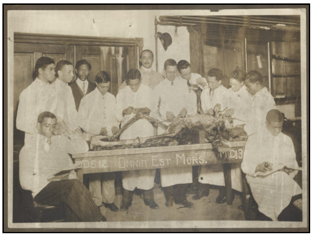
image shows 13 African American men standing or seated with reference materials around a badly decomposed cadaver on a table. Most of the men are wearing white lab coats; two may be teachers. Written on the side of the table is, "DDS 12 Omnia Est Mors. MD13," possibly the slogan for the dental class of 1912 and the medical class of 1913.