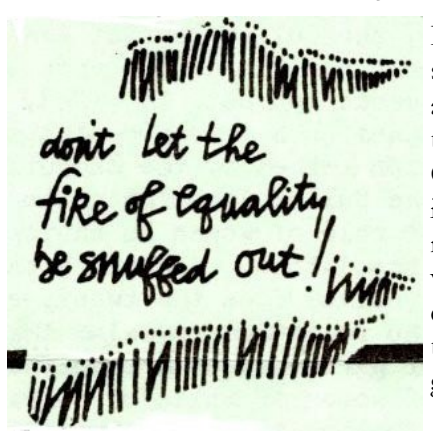
From the "Southern Baptists for Family and Equal Rights" newsletter, found in the Resource Center for Women and Ministry in the South records.