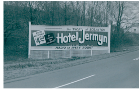
A Smith Company billboard in Scranton, PA.

The Smith Company was established in 1906 in Scranton, PA, and created outdoor advertising for its clients. The Smith Company photograph archive consists of approximately 78 photographs of billboards and outdoor signs produced by the company. Most are location shots of roadside signs and represent primarily local businesses from northern Pennsylvania to Wilmington, NC.